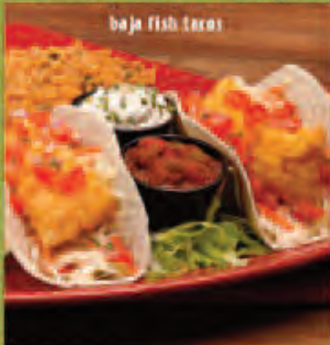
baja fish tacos