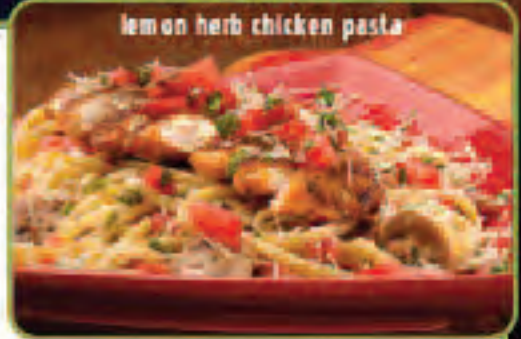
lemon herb chicken pasta

Linguine tossed with sautéed mushrooms, fresh bruschetta, chopped bacon and white butter sauce. Topped with a char-grilled chicken breast and fresh bruschetta. 12.99 Lunch-sized portion 9.99