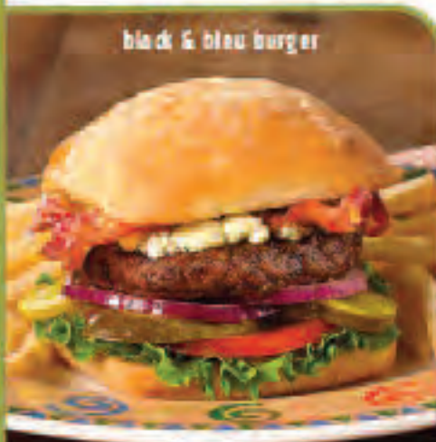
black & bleu burger

Turkey, applewood smoked bacon, provolone cheese and sundried tomato pesto mayonnaise on a grilled basil focaccia loaf. Served with French fries or Kettle chips. 9.99