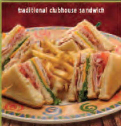
traditional clubhouse sandwich